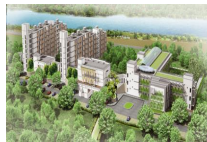
Representative picture of upcoming IIPH Gandhinagar permanent campus

1000+ public health professionals graduated from on-campus programs (65% sponsored by governments), 17,000+ trained in short term programs and 1300+ through distance learning and scaling up (figures since 2008)