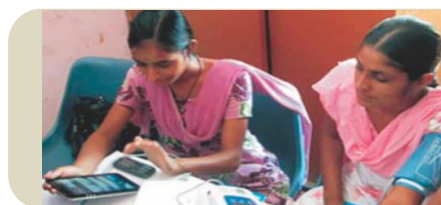
Community workers using Swasthya Slate

Innovation example: 'Swasthya Slate', a unique tablet based affordable and portable diagnostic platform for use by health workers in rural/remote areas Being used in six districts of J&K under National Health Mission; piloted in 'Mohalla Clinic' of Delhi Government and interest from other states; being evaluated by corporates/ NGOs for community health programs under CSR.